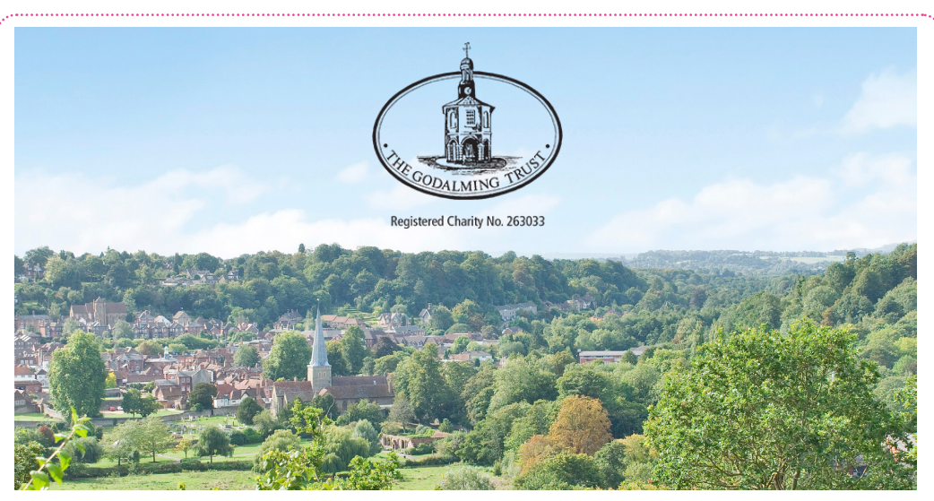
THE GODALMING TRUST is a voluntary organisation working to maintain our heritage and quality of life in Godalming and Farncombe by promoting high standards of planning, conservation and regeneration.

Godalming and its surrounding lands are special. Set in the valley of the River Wey, with its unique Lammas Lands, the town is a vibrant place which retains a sense of community and attracts many visitors.