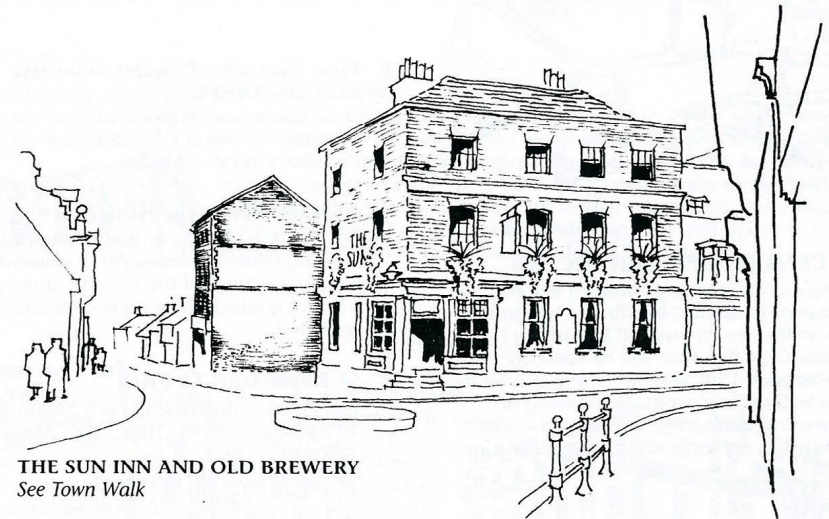
THE SUN INN AND OLD BREWERY See Town Walk

The Godalming Trust is a registered Charity, formed in 1965. Its chief aims are to protect, preserve, develop and improve features of general public amenity, historic, architectural or artistic interest, together with the natural beauty of Godalming and the surrounding areas.